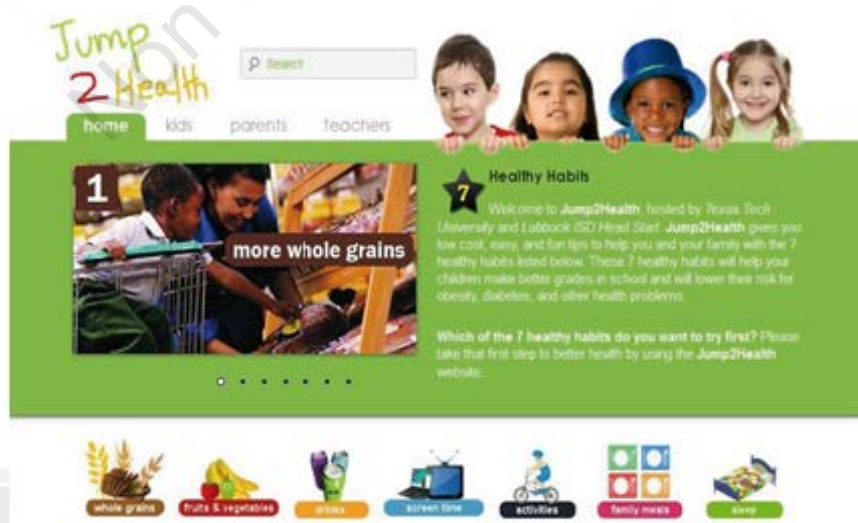
Figure 2. Sample Webpage from the Jump2Health Website TM Developed from Phase I Focus Group Discussions with Head Start Parents and Teachers.